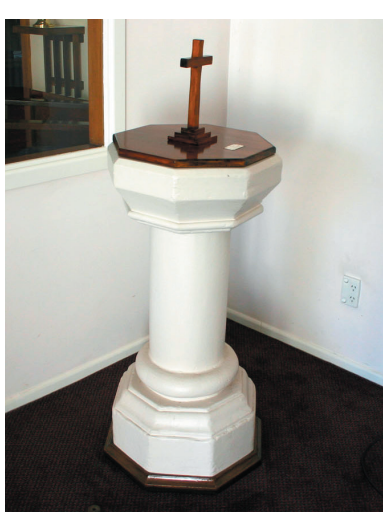
The limestone font, which was originally in old St Mary's.