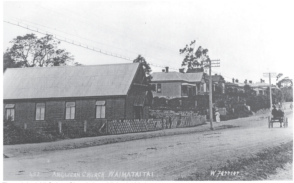
The original All Saints Church (established 1907)