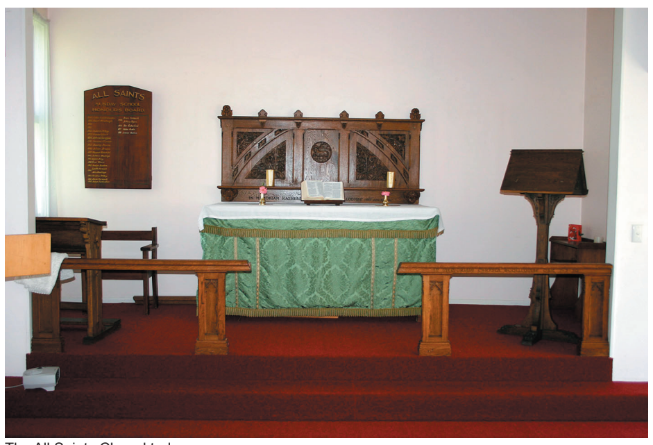
The All Saints Chapel today