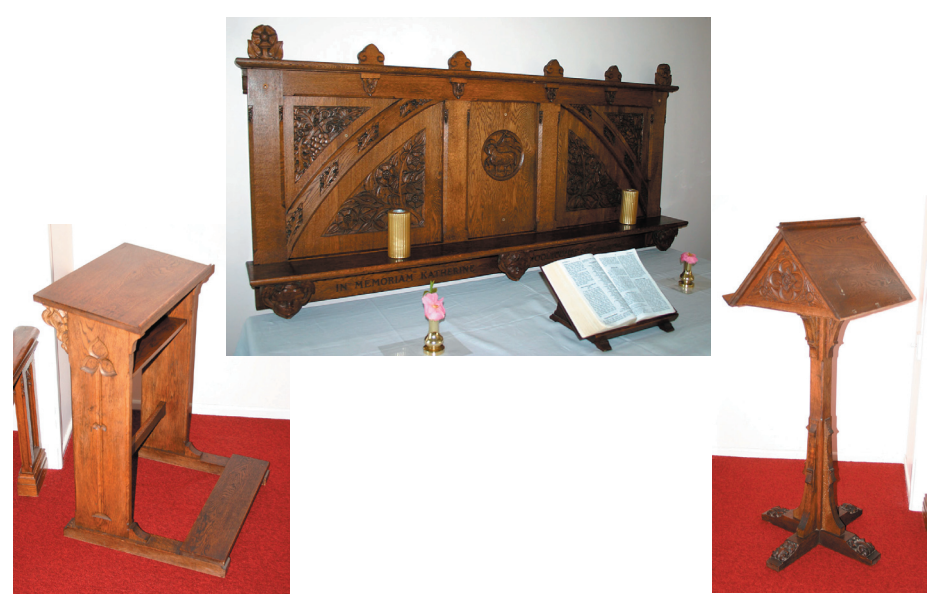
The Gurnsey wood carvings in the chapel at St Philip and All Saints.