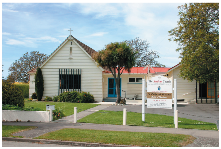
St Philip and All Saints, Marchwiel. The All Saints Chapel is attached to the present church.