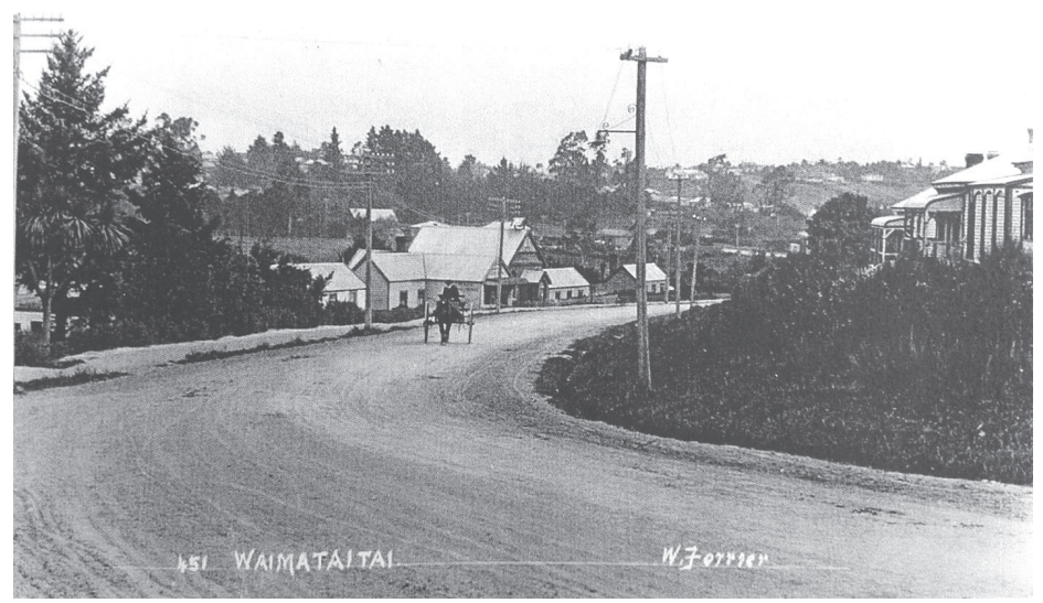
The brick All Saints building in Evans Street (established 1924). The church is in the centre of this photograph. The original wooden church is visible in the distance, to the left of the roof.