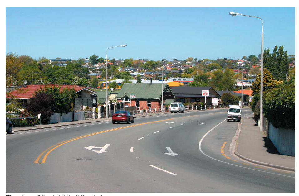
The view of the brick building today.