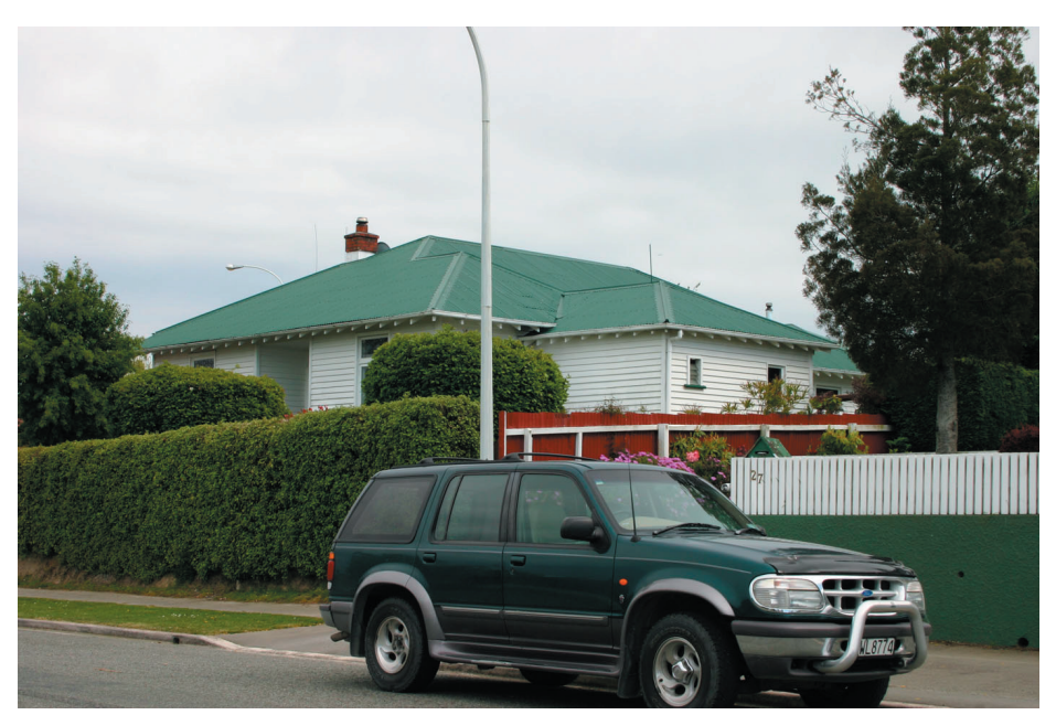
(Above and below) The house on the corner of Marchwiel and Selwyn Streets, incorporating the original All Saints wooden building.